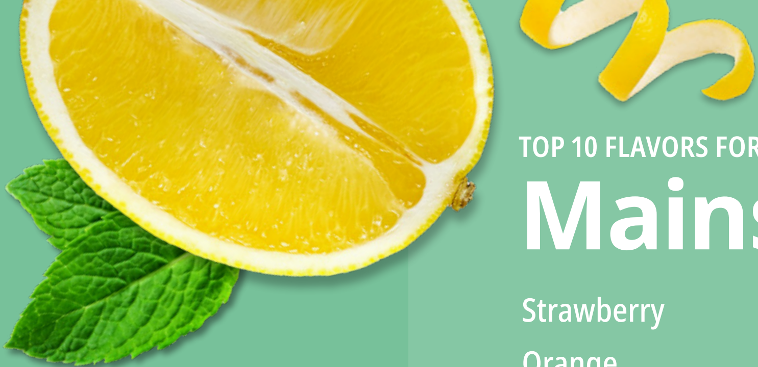
TOP 10 FLAVORS FOR THE PAST 5 YEARS